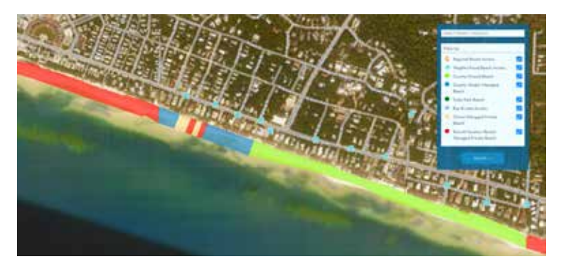
Walton County Tourism's new interactive beach map will help visitors and residents better understand where and how they can access Walton County beaches.

Walton County Tourism launched an awareness campaign clarifying beach dynamics for residents and visitors. This includes an interactive map with geolocation technology, more clearly distinguishing between county-owned public and privately managed beaches. Users can input addresses to find nearby beach access and usage details. Signage with QR codes linking to the map will be placed along beaches. This initiative aims to address inquiries about beach access effectively and to ensure visitors enjoy the best possible experience. WaltonCountyFLTourism.com