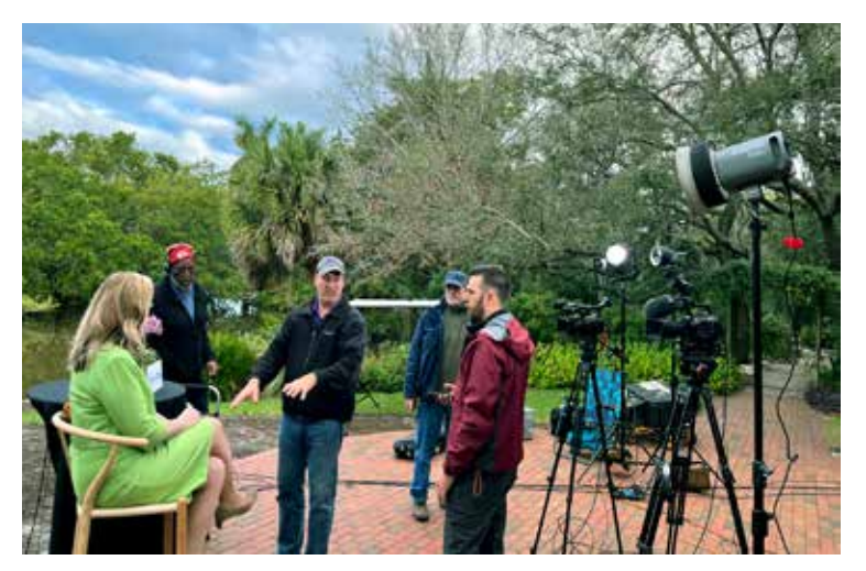
KEF Media associates work to perfect the lighting for the interviewees and the backdrop for the media tour.

Visit Sarasota County (VSC) arranged a satellite media tour this year to showcase the newest, most updated outdoor and nature offerings in the county. Spokespeople representing Marie Selby Botanical Gardens, The Bay Park Conservancy, and The Green Orchid Restaurant participated in more than 25 interviews featured on TV and radio stations across the country.