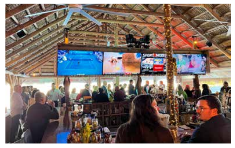
Members of Visit Sarasota County and the Venice Area Chamber of Commerce gather for coffee and networking at a local restaurant.

Visit Sarasota County hosts monthly Partner Coffee events, but recently held one as a co-event in conjunction with the Venice Area Chamber of Commerce. Held at Pop's Sunset Grill, both a VSC member and a Venice COC member, each organization invited members to enjoy a water-view breakfast and outstanding networking. With nearly 100 attendees, new relationships were built and new partners were gained by each organization, which work collaboratively as community partners in multiple capacities. VisitSarasota.com