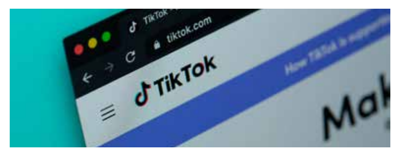
Prohibited applications on government-issued devices are QQ, TikTok, WeChat, VKontakte, and Kaspersky.

In December 2023, DMS finalized the rule implementing the TikTok ban. The full text of the final rule can be viewed here: https://bit.ly/tiktok-dms-rule