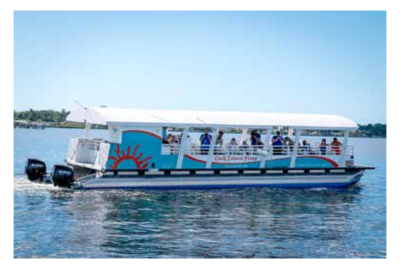
The Gulf Islands Ferry offers services from downtown Bradenton to Anna Maria Island four days a week.

The CVB also celebrated the maiden voyage of the Gulf Islands Ferry. The water ferry connects downtown Bradenton to the Anna Maria City Pier and the Bridge Street Pier. With two boats in service, the Downtown Duchess and Miss Anna Maria, the ferry is an affordable way for beachgoers to avoid stressful highseason traffic. The fully ADA-accessible ferries are powered by renewable energy sources and feature modern energy-efficient design elements.