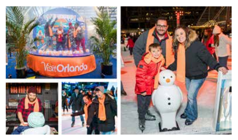
Visit Orlando inspires travel to Orlando with engaging activations, including a unique skating experience, photo ops, and hot chocolate.

Visit Orlando brought a little warm sunshine to New York City's Winter Village at Bryant Park for its second annual Warm Up with Visit Orlando activation. Thousands of New Yorkers enjoyed Orlando Skate Nights and Family SUNday FUNday, ice skating to a customized sunny Orlando Playlist around an orange glow ice rink. Families captured memories in Visit Orlando's "No Snow" sun globe and Wall of Warm, sipped hot chocolate, and bundled up with branded orange scarves. Winter Doesn't Exist is a complete integrated campaign that combines advertising, publicity, social media, activations, and more to inspire travel to Orlando. VisitOrlando.com