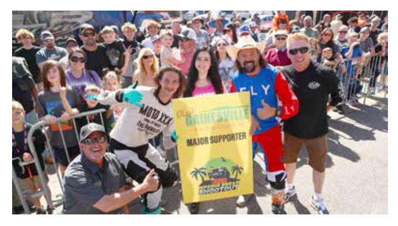
The NMRA brought its iconic Spring Break Shootout event to Gainesville Raceway for the first time with the support of Visit Gainesville, Alachua County.

Each year in March, 70,000 fans rev up for fun at Gainesville Raceway for four days of exhilarating drag racing at Gatornationals, one of Alachua County's busiest tourism weekends. It is estimated that Gatornationals supports 1,700 local jobs and creates $9 million in direct spending and $14 million in induced economic impact. Together with the NHRA Baby Gators competition and the iconic NMRA Spring Break Shootout in February, the three races further establish Gainesville Raceway as a beloved destination for race fans. VisitGainesville.com