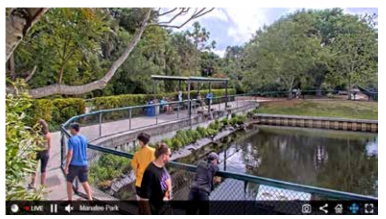
The webcam at Manatee park is a partnership with Lee County Parks and Recreation.

Fiscal year-to-date tax collections are 15% higher than fiscal year 2023.