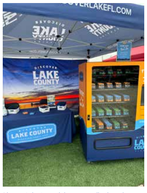
Discover Lake County brings personalized travel itineraries and custom earplugs to Smorgasburg Miami.

In February, Discover Lake County traveled to South Florida to spotlight the destination's many draws to Smorgasburg Miami attendees. Highlighting activities for nature enthusiasts, foodies, culture junkies, and shopaholics, the Discover Lake County team engaged with hundreds of people and more than 100 leads were collected through the use of a custom vending machine. The activation was a huge hit, dispensing branded ear plugs