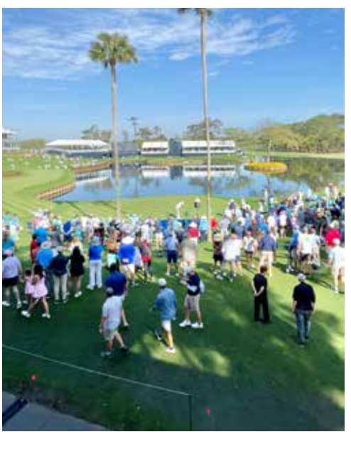
The Hospitality House at TPC Sawgrass provides guests of St. Johns County tourism guests the perfect view of the world-famous 17<sup>th</sup> island hole during THE PLAYERS Championship.

The 50<sup>th</sup> annual PLAYERS Championship took place at TPC Sawgrass in Ponte Vedra Beach Mar. 12-17. As in years past, the St. Johns County TDC and the St. Augustine, Ponte Vedra VCB have partnered with the PGA Tour to host community leaders, meetings planners, travel professionals, and leisure iournalists to share the excitement and the importance of professional golf on Florida's Historic Coast. FloridasHistoric-Coast.com