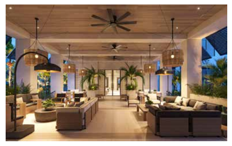
AC Hotel Naples 5<sup>th</sup> Avenue began welcoming guests in December 2023.

The Hospitality Sales & Marketing Association International (HSMAI) presented the 2023 Adrian Awards in February 2024, and Florida's Paradise Coast won big. Most notably, the next generation of the already successful Only Paradise Will Do campaign featuring a bold new look and large "ONLY" graphic took home one of the CVB's four President's Awards. This signature "ONLY" immediately captured the attention of the destination's audiences and conveyed the exclusive