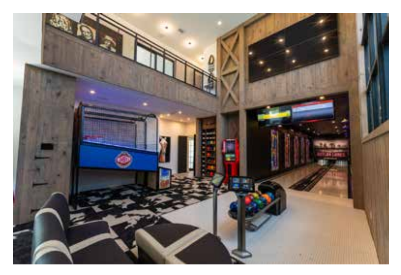
The pictured game room is on the first level of Morlando, located at 1228 Grand Traverse Parkway in Kissimmee.

Known as the Vacation Home Capital of the World®, Kissimmee is a hub for a variety of vacation rentals, from two-bedroom condominiums to 15-bedroom mega mansions, many of which are expertly decorated and themed. The latest home to hit the market is Morlando, a 16,000 sq. ft. house of epic entertainment. A three-story rocket room and play area with 18 bunk beds, laser tag, a bowling alley, and a theater room are among its features. Learn more at Jeeves Florida Rentals and search "Morlando Space Mansion." ExperienceKissimmee.com