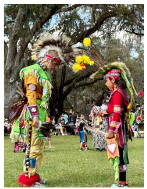
Sponsored by Palm Coast and the Flagler Beaches, the Princess Place Preserve Pow Wow features traditional Native American dancing.

In February, Palm Coast and the Flagler Beaches sponsored the 9<sup>th</sup> annual Princess Place Preserve Pow Wow, a two-day festival highlighting Florida's indigenous peoples. Attendees got an up-close look at Native American culture via traditional dance performances, weapons demonstrations, encampment displays, wildlife exhibits, and more. It was PCFB's second year of sponsoring the event, which had more than 7,000 attendees. VisitFlagler.com