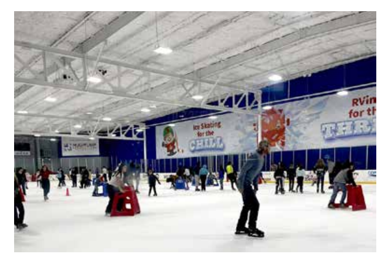
People skate at the Community First Igloo as part of the Visit Jacksonville Explorers program.

Visit Jacksonville recently relaunched its popular Beaches Explorers program as Visit Jacksonville Explorers to give visitors an opportunity to explore what there is to see and do in all areas of Jacksonville. The first two Explorers events of the calendar year were a big success. A standing-room-only crowd competed in Jacksonville trivia night at Engine 15 Brewing, and nearly 100 kids participated in ice skating at the Community First Igloo. VisitJacksonville.com