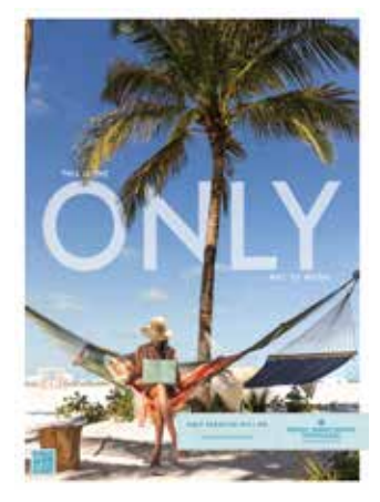
Florida's Paradise Coast ONLY Campaign ad promises an elevated experience.

While the destination hasn't shied away from awards, there have also been exciting openings worth noting. The AC Hotel Naples welcomed guests beginning in December 2023, bringing a new offering to the iconic 5<sup>th</sup> Avenue district, steps from Tin City. Welcoming guests with unparalleled sophistication to Florida's Paradise Coast,