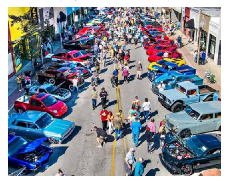
Car enthusiasts fill the streets of Historic Downtown Panama City for the CAUSEway Car Show.

Destination Panama City was thrilled to welcome back the fourth annual CAUSEway Car Show to Historic Downtown Panama City. This community event, hosted by the dedicated nonprofit 850 Crew Car Club, raised an impressive $28,000 to support local children battling cancer. More than 8,000 spectators joined the festivities, showcasing a shared passion for classic cars and a heartwarming commitment to giving back. DestinationPanamaCity.com