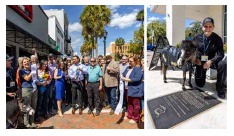
Community leaders celebrate the installation of plaques honoring equine champions at a ribbon cutting in downtown Ocala. One of the plaque honorees, Magic, attended the event and visited her plaque.

Ocala/Marion County recently completed the interactive Walk of Champions experience, providing the opportunity to discover history behind the Horse Capital of the World<sup>®</sup>. Twenty-four bronze plaques now adorn two sidewalk blocks adjacent to Ocala's Historic Downtown Square, each honoring a nationally recognized equine champion connected to the destination. Complementing the physical plaques, the OcalaMarion Travel Guide phone app features a Walk of Champions digital experience that launched early last summer. OcalaMarion.com