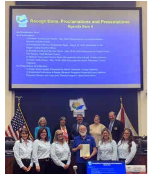
Palm Coast and the Flagler Beaches staff receive a NTTW proclamation from the Flagler County BOCC.

guest appearances on a radio show to educate locals on the value of tourism.