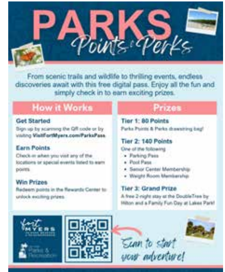
Parks, Points & Perks makes it easy to enjoy the outdoors and discover new adventures in Lee County.

The Lee County VCB recently partnered with Lee County Parks & Recreation to launch Parks, Points & Perks, a free pass that encourages locals and visitors to explore more than 30 parks, preserves, beaches, and recreation sites through May 2026. Participants can earn points and win prizes by checking in at locations like Six Mile Cypress Slough Preserve, Dog Beach, and Bowditch Point Park. Visitors are invited to get outdoors and start their adventure today at VisitFortMyers.com/ParksPass .