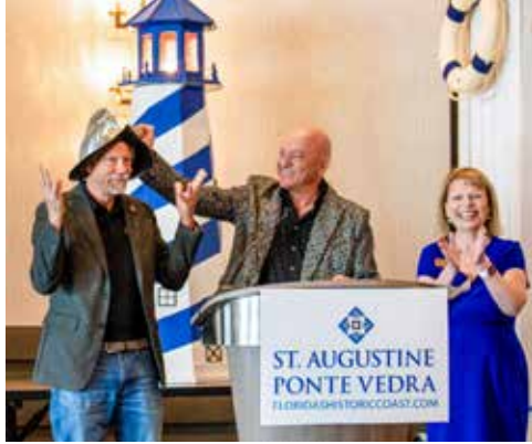
St. Augustine, Ponte Vedra & The Beaches VCB recognizes tourism leaders with the Tourism Impact Award at the May 8 Vision & Voyage Industry celebration.