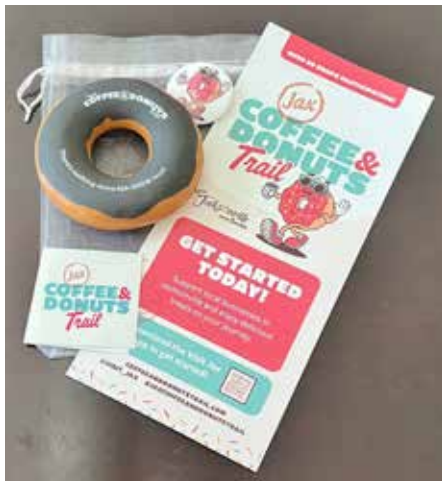
Items included in the Jax Coffee & Donut Trail themed welcome bag for passengers arriving at Jacksonville International Airport on an inaugural flight

Working closely with Jacksonville International Airport, Visit Jacksonville created special welcome bags for passengers of the inaugural flight from Des Moines, Iowa, to Jacksonville on Allegiant Airlines. With an early morning flight time, the bag promoted the Jax Coffee & Donuts Trail with a donut-shaped stress reliever, stickers, and more. Visit Jacksonville is also working to welcome new flights from Toronto Pearson International Airport on Air Canada, Akron-Canton Airport (Ohio) on Allegiant Airlines, and Wilmington Airport (Delaware) on Avelo Airlines. VisitJacksonville.com