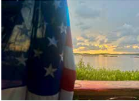
Levy County celebrates its unique contributions to Florida tourism.

ways to explore the natural resources in Levy County. #LoveLevy