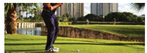
H.O.T. Challenge golf tournament at JW Marriott Miami Turnberry Resort

Throughout May, the Greater Miami CVB celebrated National Travel & Tourism Week with events spotlighting tourism's impact on Greater Miami and Miami Beach. Highlights included the H.O.T. Challenge golf tournament, the State of the Travel & Tourism Industry event, and hosting the Meaningful Travel Roadshow kickoff. From cultural vibrancy to sustainability and economic vitality, the message was clear: tourism is a community investment that enriches the area's neighborhoods, supports small businesses, and enhances quality of life across Miami-Dade.