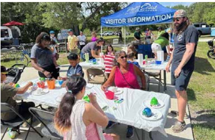
Attendees paint ceramic turtles during the Celebrate Trails Day event on Apr. 26.

Palm Coast and the Flagler Beaches hosted its annual Celebrate Trails Day event in April. Held at Waterfront Park, the event included interactive booths and activities; fun games and crafts like cornhole, chalk art, and turtle painting; and a 30-minute guided nature walk. Celebrate Trails Day is part of Palm Coast and the Flagler Beaches' continued focus on increasing ecotourism opportunities. VisitFlagler.com