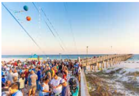
Tourism Appreciation Day draws a crowd to the M.B. Miller Pier on Panama City Beach.

To celebrate Tourism Appreciation Week, Visit Panama City Beach hosted their annual Tourism Appreciation Day on May 7. This event was held at the M.B. Miller Park County Pier and included free food, live music, ice cream, and more. Visit Panama City Beach is proud to host this event each year as a way to thank and celebrate hospitality workers and the many individuals who work to make the community a vibrant destination.