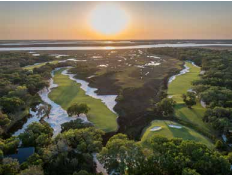
A legendary course in Northeast Florida, redesigned for today

Northeast Florida continues enhancing its golf experience. Omni Amelia Island Resort & Spa proudly announces the May 16 reopening of the iconic Oak Marsh course, following a $7.4 million renovation by Beau Welling Design. The updates honor Pete Dye's 1972 vision while modernizing play with regressed greens, rebuilt bunkers, and expanded native areas. This refreshed course blends tradition and innovation—offering a stunning evolution ready to challenge and inspire the next generation of golfers. Florida-Golf.org