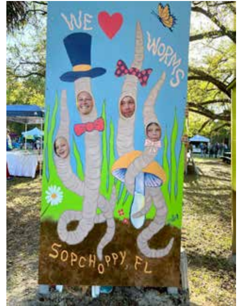
Festival-goers get into the spirit of the Sopchoppy Worm Gruntin' Festival—a quirky, family-friendly celebration of Wakulla County's most unusual tradition.

The 2025 Worm Gruntin' Festival drew record crowds to historic Sopchoppy, Florida—officially the Worm Gruntin' Capital of the World. Held Apr. 12 in the heart of the Apalachicola National Forest in North Florida, the event featured worm-grunting demos, the Wiggle Worm Fun Run, vendors, live music, and family activities. Through this event, Visit Wakulla showcased how small-town charm and unique traditions can create big tourism wins and media buzz. VisitWakulla.com