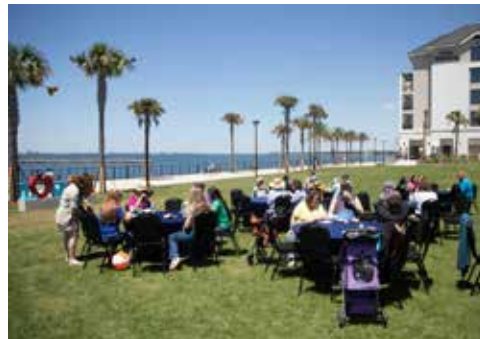
Locals and visitors gather bayside for burgers, music, and community at Destination Panama City's Tourism Appreciation Day cookout.

For this year's Tourism Appreciation Day, Destination Panama City partnered for the first time with Hotel Indigo and Harrison's Kitchen & Bar to host a bayside cookout for the community. The event brought together more than 250 locals and visitors to enjoy grilled burgers, hot dogs, and live music on the waterfront green space. This new partnership added a fresh, local flavor to the annual celebration and created a welcoming space to thank those who help make tourism thrive in Panama City.