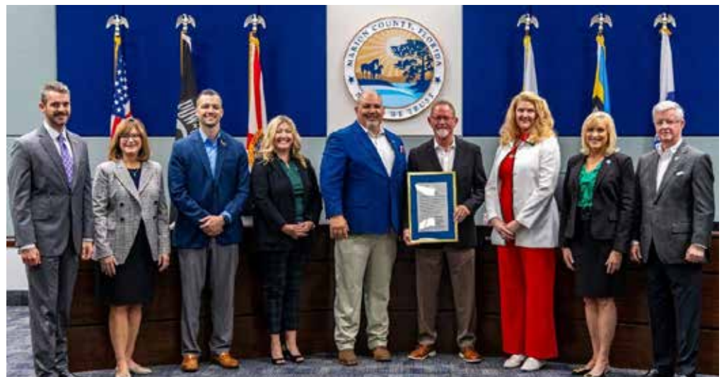
Marion County Board of County Commissioners presents a proclamation recognizing NTTW with the Ocala/Marion County VCB team and TDC chair.

The Ocala/Marion County VCB celebrated National Travel & Tourism Week with a proclamation and various initiatives all week long. The VCB released a new "Marion Insider's Guide" episode on YouTube, launched a postcard-themed photography contest showcasing the destination's charm, and offered exciting ticket giveaways to the Rock the Country music festival held May 9-10.