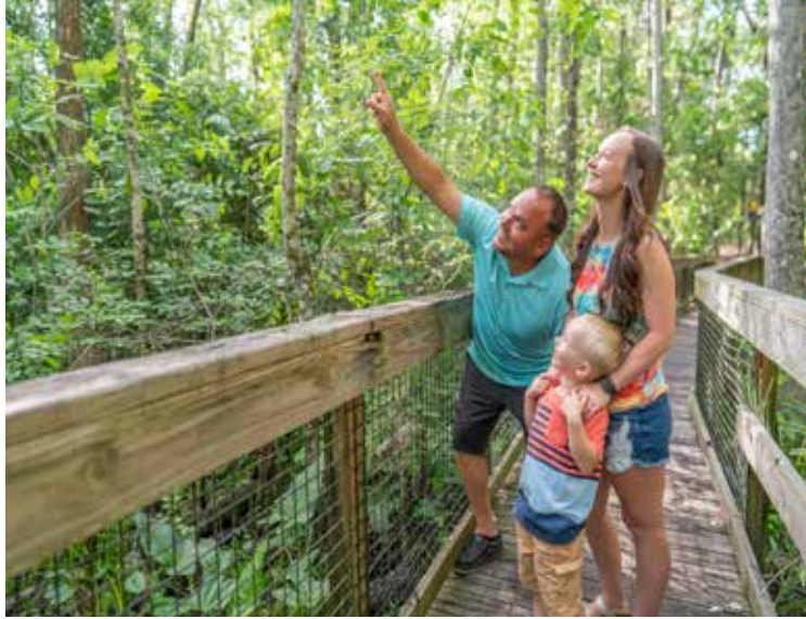
Public facilities, such as pedestrian walkways, may be funded by Tourist Development Taxes if at least 40 percent of all TDT revenues are used for promoting and advertising tourism.

We sometimes receive questions from Destinations Florida members about the meaning of the "40 percent" provision