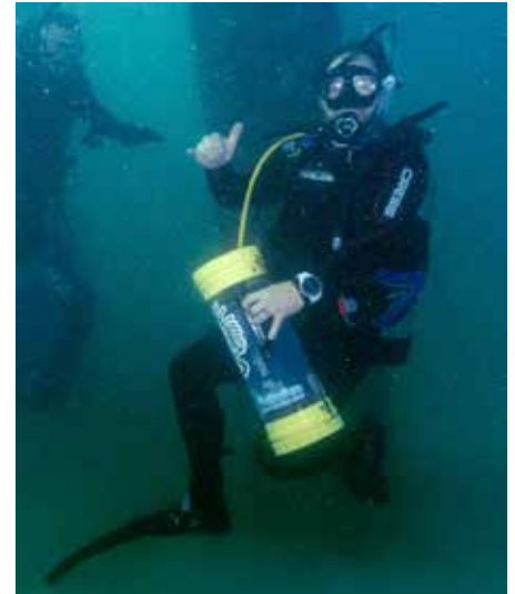
A diver takes part in April’s cleanup beneath the Okaloosa Island Pier, helping remove debris as part of a record-setting conservation effort.

In April, more than 80 divers gathered beneath the Okaloosa Island Pier for the first of two annual cleanup dives, removing nearly 57 pounds of debris—the smallest amount in the event’s history. This milestone highlights the ongoing success of local conservation efforts. The cleanup is a collaborative effort involving several organizations, including the Gulfarium Marine Adventure Park and Okaloosa County agencies. As an added bonus, divers were granted rare access to an area that’s typically off limits. A second cleanup dive is scheduled for late summer or early fall. DestinFWB.com