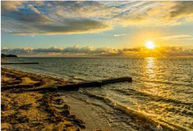
Sunrise on historic Virginia Key Beach

The Greater Miami CVB hosted the first stop of Tourism Cares' Meaningful Travel Roadshow in May, connecting travel professionals and local change makers to showcase how Greater Miami blends vibrant culture with sustainability and social impact. The Roadshow explored how collaboration and creativity are transforming Miami-Dade County neighborhoods and natural spaces, immersing participants in local culture, history, and environment and gaining insights from conservationists, accessibility advocates, and industry leaders on innovative ways to promote responsible tourism. MiamiandMiamiBeach.com