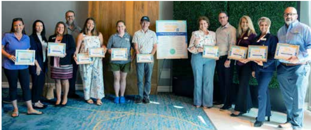
The Daytona Beach Area CVB recognized area businesses and attractions with the fourth annual Visitors' Choice awards at the annual Lodging & Hospitality Association of Volusia County's National Travel & Tourism breakfast at the Hard Rock Hotel Daytona Beach.

The visitors have spoken, and the Daytona Beach Area CVB celebrated National Travel & Tourism Week with its fourth annual Visitors' Choice Awards, which recognizes businesses and attractions that vacationers enjoyed the most in the destination. The program honors visitors' most beloved attractions and businesses through a survey that was sent to Daytona Beach area visitors in the CVB's database. Honorees included Volusia County Beaches, Daytona International Speedway, Ponce Inlet Lighthouse, and Museum of Arts & Sciences.