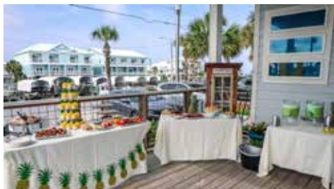
Punch on the Porch at Mexico Beach

Mexico Beach Welcome Center celebrated National Travel & Tourism Week with the annual Punch on the Porch event. The free event was open to everyone to enjoy light refreshments, score wonderful giveaways, learn more on industry insights, and of course partake in some amazing punch! The event gave visitors and locals an opportunity to engage and celebrate Mexico Beach's tourism industry. There were even visitors who made a trip from Illinois to ensure they were able to attend.