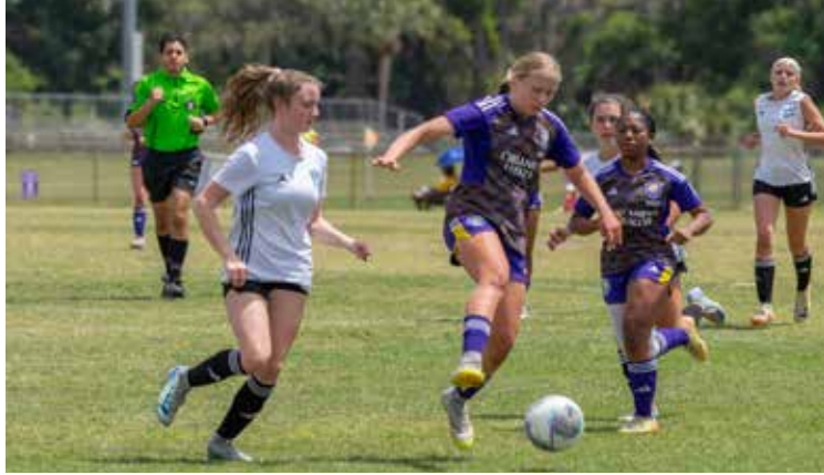
Athletes compete during the 2025 Easter International Cup, hosted for the first time in Seminole County.

Easter week kicked off with a win for Seminole County as they hosted the Easter International Cup for the first time, Apr. 16-19. The tournament welcomed more than 65 girls' soccer teams and 1,000+ athletes and spectators from across the country. Held at Seminole County's premier sports complexes, the event generated an estimated $1.1 million in direct economic impact, reinforcing the county's growing reputation as a top-tier destination for youth sports tourism. DoOrlandoNorth.com