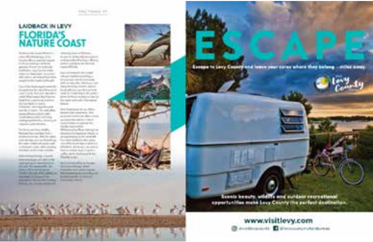
The "Laidback in Levy" article marks the beginning of a campaign that promotes vacations in Levy County.

Levy County is working to establish a unique brand they think guests will appreciate. The Laidback in Levy article kicks off a marketing campaign for a vacation destination with family and friends away from the busy and hurried life that we live day to day. This article is the first of many promotions to showcase all the places in Levy County where visitors can relax and enjoy time well spent with the ones they love making memories that will last a lifetime. #LaidbackLevy #LoveLevy #LoveLevyLife VisitLevy.com