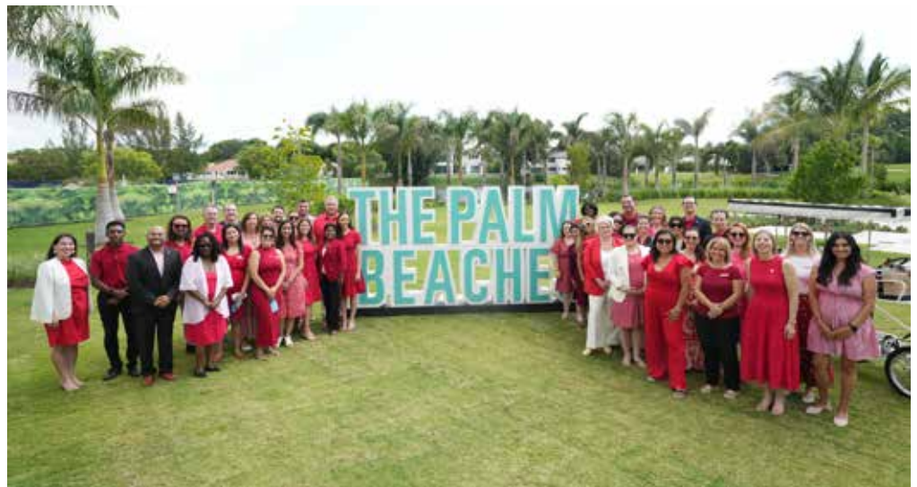
DTPB's team commemorates Travel Rally Day with a group photo.

While celebrating Travel Rally Day, Discover The Palm Beaches (DTPB) announced record-breaking tourism numbers for the first quarter of 2025. Visitation increased by 8.8% year over year to 3 million visitors, and visitation spending grew 8%, reaching $2.44 billion. At the event, leadership presented the Raymond F. Kravis Center for the Performing Arts with the 33 rd annual Providencia Award, and The Singer Oceanfront Resort and Tucan Media Marketing received Partner of the Year awards.