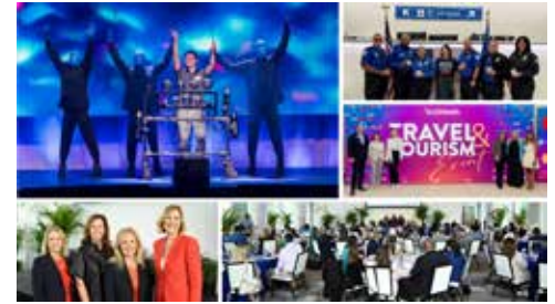
Visit Orlando hosts several initiatives during NTTW, including its annual Travel & Tourism Event, a joint chamber celebration, and thanking frontline workers.

contributions in driving the success of Orlando's tourism industry.