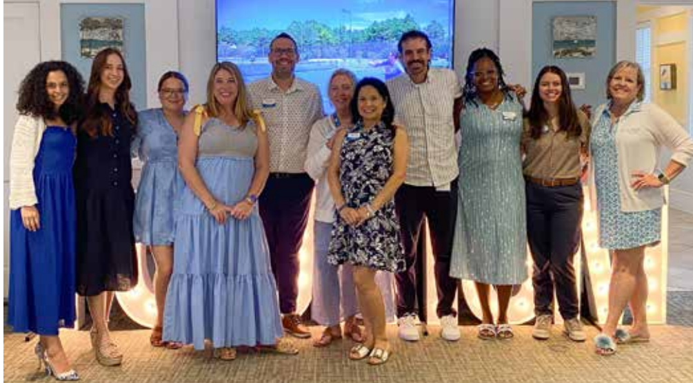
Team members from Walton County Tourism end the weeklong festivities with an open house and interactive experiences highlighting the economic and cultural impact of tourism in the county.

Walton County Tourism celebrated National Travel & Tourism Week with a mix of education, exploration, and conversation highlighting the county's No. 1 economic driver. As the sponsor of the local Chamber luncheon, they showcased an insightful presentation on artificial intelligence. Additionally, they hosted an interactive open house where visitors received passports that encouraged conversation, challenging them to collect signatures from each department for a prize. Visitors also enjoyed sweet and savory local treats and giveaways.