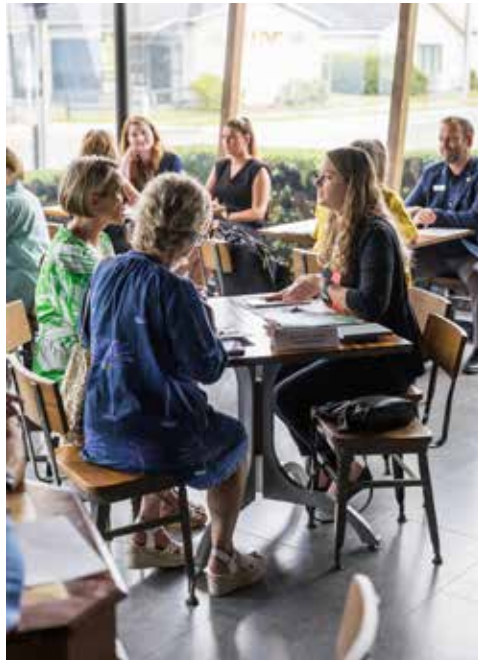
Amelia Island tourism partners cross-collaborate during NTTW.

of partnerships in strengthening Amelia Island's tourism economy.