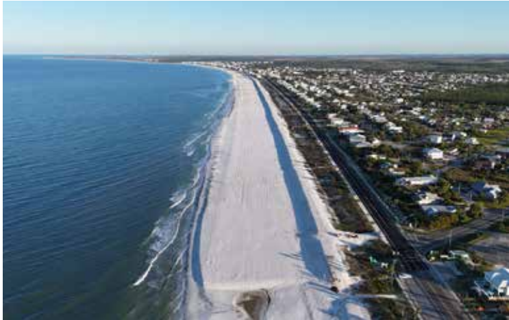
Mexico Beach showcases first full-scale beach restoration project completion.

Discover Mexico Beach has completed its first full-scale beach restoration that provided enhanced storm protection and habitats for nesting shorebirds and sea turtles. Over 1 million cubic yards of sand and 600,000+ plants were placed along the three-plus miles of shoreline. “This project has been a long time coming,” said Kimberly Shoaf, MBCDC president. “We’re grateful to everyone involved. Our new beach is beautiful, and we’re elated to showcase the results of these hard efforts.” MexicoBeach.com