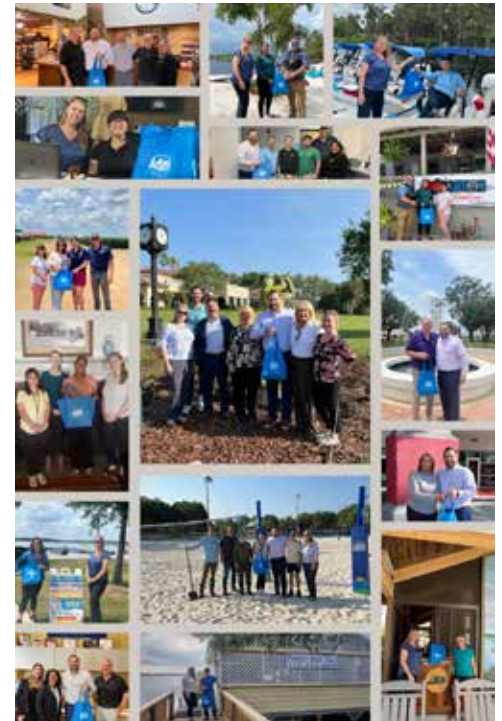
Discover Lake County visits local partners to showcase their contributions to the region's growing tourism community.

During National Travel & Tourism Week, Discover Lake County celebrated by visiting local partners and showcasing the region's vibrant tourism community. The team connected with businesses and organizations that help make Lake County a top destination. Adding a sweet touch to the visits, The Littlest Bake Shop provided delicious treats, making the week even more memorable. The celebration highlighted the importance of collaboration and community in supporting Lake County's growing travel and tourism industry.