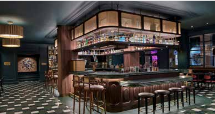
Featured in Condé Nast Traveler, the new Tropicado Mojito Bar is located in the renovated La Concha Key West on Duval Street.

As the result of a hosted research visit by travel writer Paul Rubio to the Florida Keys & Key West, 13 stories appeared in Condé Nast Traveler, including: "15 Best Hotels in the Florida Keys" and "10 Best Bars in Keys West from Duval Street to Stock Island," several of which were syndicated, generating more than 552 million earned media impressions. The stories profile newly renovated and well-established lodging properties across the island chain and celebrate both longtime favorites and new watering holes in Key West. Fla-Keys.com