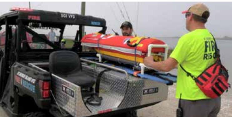
St. George Island firefighters with EMILY, a water rescue drone

The St. George Island Fire Department recently showed off EMILY, its new water rescue device, which was purchased with money from the Franklin County TDC. EMILY is a water rescue drone that allows rescuers to reach a struggling swimmer without having to enter the water themselves. The TDC approved the funding under a rule that allows up to 10% of the county's Tourist Development Tax proceeds to fund eligible public safety services. The investment ensures that the county remains a positive and safe environment for visitors and residents alike. FloridasForgottenCoast.com