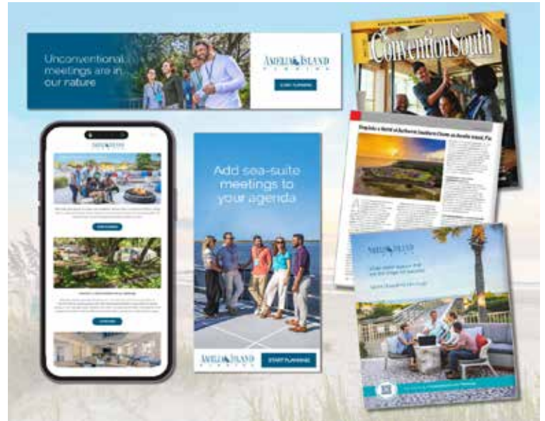
Amelia Island's Island Inspired Meetings campaign assets

The Amelia Island CVB aimed to redefine the meeting experience with the Island Inspired Meetings campaign that ran Jan. 2024–Mar. 2025, blending wellness, sustainability, and immersive storytelling to meet planners' evolving needs. With nearly 9.4 million impressions, 238 RFPs, and record-breaking engagement, Amelia Island was perfectly positioned as the go-to destination for meaningful, high-impact events. AmeliaIsland.com