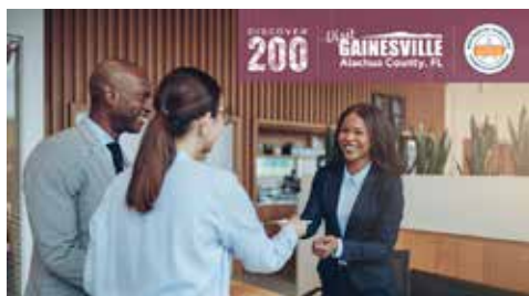
Workforce First—Visit Gainesville, Alachua County led NTTW with a focus on hospitality advocacy, supporting and celebrating the tourism and hospitality workforce through on-site visits, professional development opportunities, and recognition of excellence across Alachua County.

professionals for delivering outstanding guest experiences.