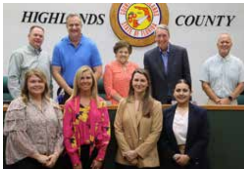
Visit Sebring staff and Highlands County commissioners recognize NTTW with a proclamation.

Visit Sebring staff and Highlands County commissioners celebrated a proclamation in honor of National Travel & Tourism Week. It highlighted the crucial role that travel and tourism play in driving economic growth, connecting communities, and showcasing the unique attractions in the area. It also underscored the ongoing efforts to promote recent HGTV renovations, which have become major points of interest.