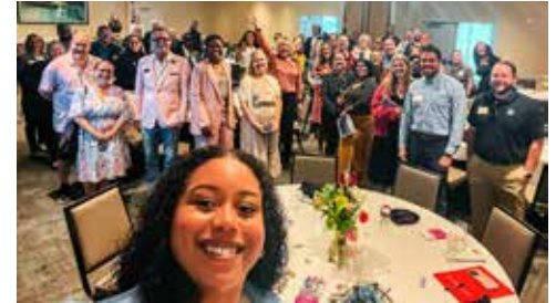
Tourism partners and community leaders celebrate NTTW in Tallahassee.

luncheon also looked ahead to exciting milestones, including Tallahassee's role as host of the 2026 World Athletics Cross Country Championships, which will draw athletes and spectators from around the globe.