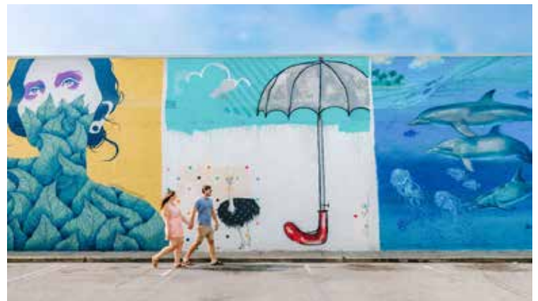
Southern Living highlights the best of Panama City, from waterfront experiences to local flavor and artistic flair.

Panama City recently earned a spotlight in Southern Living with a feature highlighting the Best Things to Do in Panama City. The article showcased the city's diverse offerings, from outdoor adventures on St. Andrews Bay to vibrant arts and culture, eclectic shopping, and standout local dining. The national recognition reinforces Panama City's growing reputation as a dynamic coastal destination with authentic charm and year-round appeal. DestinationPanamaCity.com