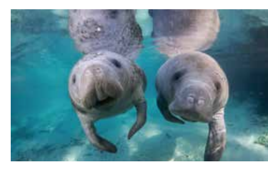
Virtual visitors to Crystal River might spot manatees via a live river cam.

Many outdoor options are still open for business, including golf courses, fishing charters, and boat ramps, so the destination continues to market those appropriately.