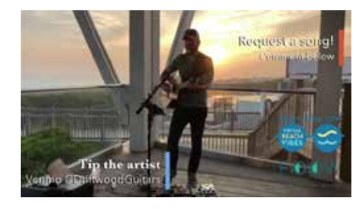
South Walton shares #VirtualBeachVibes.

The Virtual Beach Vibes hashtag is also used when promoting virtual tours of each of South Walton's 16 beach neighborhoods on social media, and users are invited to kick back at home and enjoy a virtual tour when they can't be there in person.