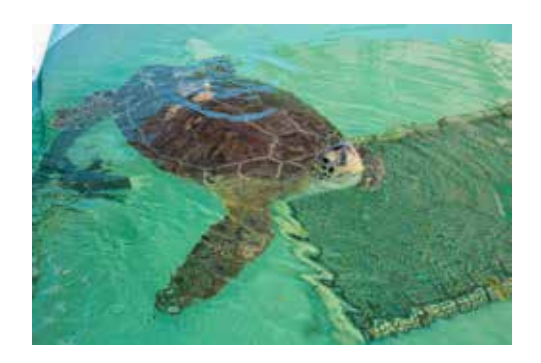
The Brevard Zoo streams educational videos from its Sea Turtle Healing Center every Wednesday at 1:30 p.m. on Facebook.

Since visitors aren't able to come to the Space Coast at the moment, the tourism office has partnered up with some of the area's best attractions like the Brevard Zoo, Kennedy Space Center, and the Merritt Island National Wildlife Refuge to bring the Space Coast directly to fans. On social media, the DMO is posting fun facts about the Space Coast, from nature to NASA, adding #BlissBreaks videos to Facebook, and sharing content from tourism partners.