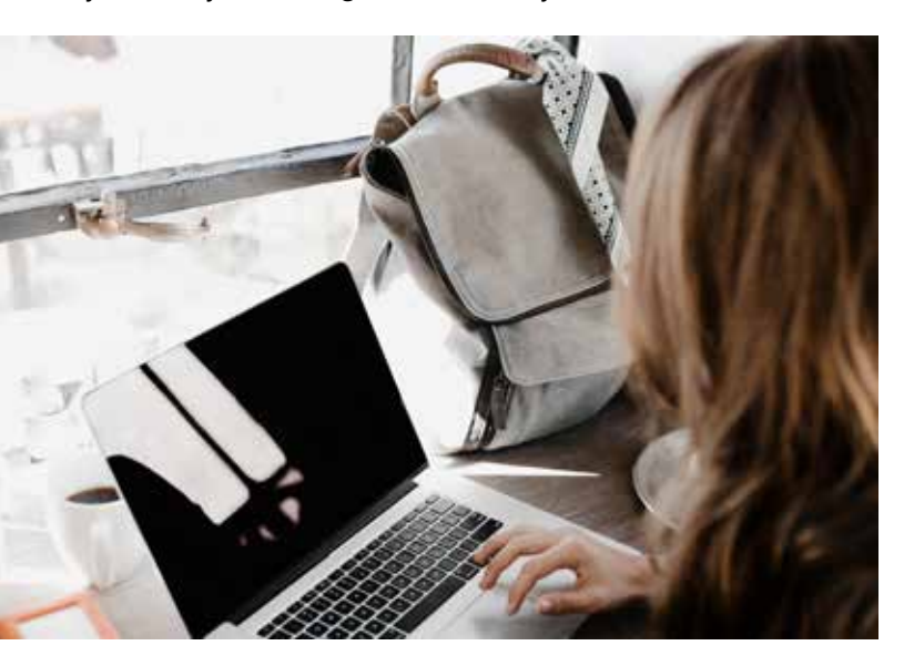
Can a DMO use TDT for travel costs incurred by travel writers or tour brokers? Maybe, maybe not.

Opinion 2020-02 is not the last word on this issue, though. It's up to you what you do in light of what it says.