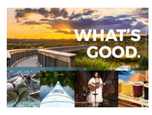
Visit Gainesville focuses on "What's Good."

Looking for wide open spaces? Visitors and residents who love Gainesville and Alachua County are getting back to nature and outdoor open-air activities as a way to find balance.