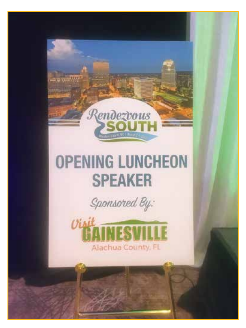
Signage from Visit Gainesville, Alachua County greets luncheon guests at Rendezvous South 2020.

In early March, the Visit Gainesville, Alachua County conference sales team attended Rendezvous South 2020, a three-day meeting planner event hosted by Conventions South in Winston-Salem, North Carolina. The VCB was proud to sponsor the luncheon speaker and to unveil the new Authentic Experiences look-book and capabilities brochure at the event. The team also unveiled promotional boxes featuring two-night stays provided by conference center partner, the Best Western Gateway Grand, to randomly selected planners. VisitGainesville.com