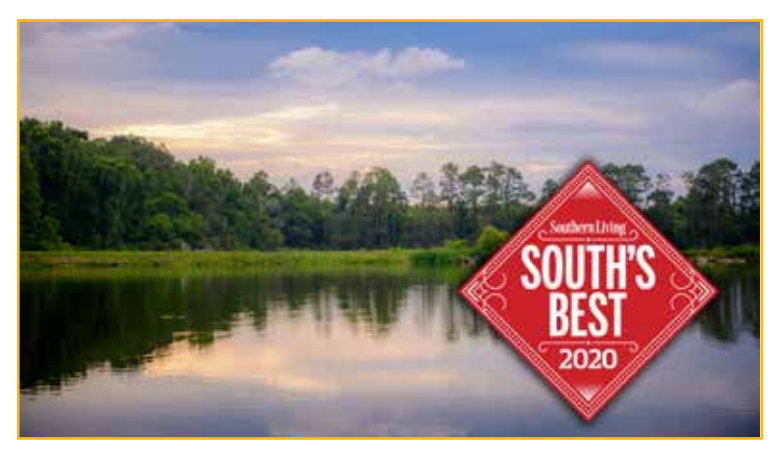
Southern Living recognizes Leon County for its history and natural beauty along with numerous wildlife preserves, animal refuges, state parks, and history museums. Pictured here is Piney Z Lake.

For the second year in a row, Leon County earned a coveted travel distinction from national magazine Southern Living . Tallahassee was named the No. 10 South's Best City, No. 9 South's Best College Town, and home to the No. 1 South's Best Garden Shop—Tallahassee Nurseries—as part of the magazine's fourth annual South's Best Awards recognizing readers' favorite Southern destinations and experiences. Tallahassee was the only Florida city listed on the South's Best College Town and was the top-ranked Florida city in the South's Best. VisitTallahassee.com