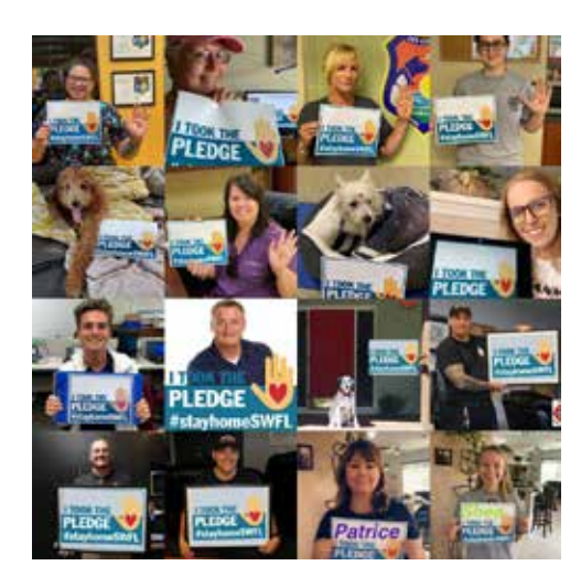
A collection of Take the Pledge participants in Lee County

Participants receive an email with "I Took the Pledge" graphics to frame photos on social media. There have been more than 5,800 social media engagements with the campaign.