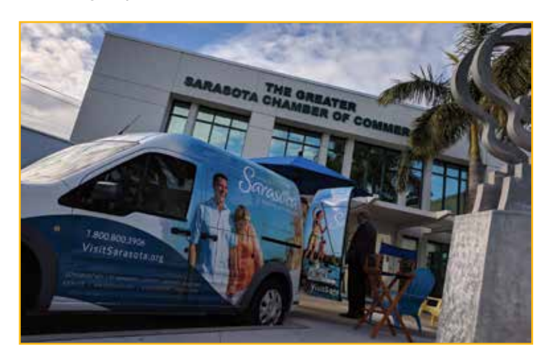
VSC Visitor Centers grow and thrive (pre-COVID-19), and look forward to busy days ahead.

VSC Visitor Centers were just hitting their peak! From January to March, visitor interactions were up YOY nearly 20%, and 2,500+ visitor guides had been requested via snail mail. VSC attributed some of this influx to two new centers in 2020 (SRQ Airport baggage claim and within the Venice Chamber) and increased Visitor Information Vehicle attendance at events. VSC believes in the effectiveness of in-person interactions and is eager to meet visitors again post-COVID-19. VisitSarasota.com