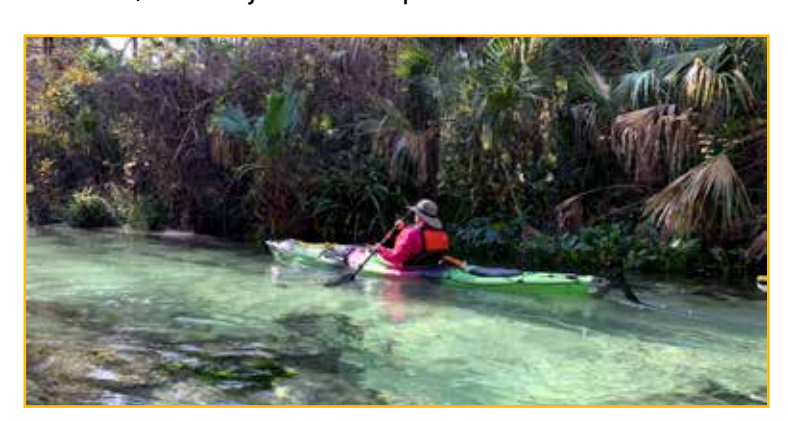
With 2,000+ waterways to explore and a vast array of nature-based activities to enjoy, Orlando North, Seminole County is an outdoor adventure hot-spot!

Waterway exploration takes many routes; for instance, in the form of a 3.5-day and 30.5-mile Wekiva/St. John's River Ramble held prior to the social distancing guidelines put in place to help mitigate the spread of the coronavirus. This Paddle Florida partnership guided individuals of all paddle levels throughout areas of Orlando North's naturally undisturbed spaces and continued into the evenings with rustic cabin camping. During this trip, paddlers crossed paths with deer, turtles, gators, manatees, and many native bird species. DoOrlandoNorth.com