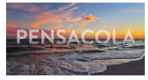
Right now, safety and health remain the top priority during the COVID-19 pandemic. Residents and future visitors can enjoy virtual events, live tours, and views of Pensacola beaches from the comfort of home.

Visit Pensacola remains a trusted and inspiring resource during the COVID-19 pandemic. Social media campaigns, resource pages, and live interactions were created to assist the community and guests during these unprecedented times. These initiatives also