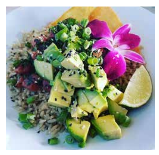
St. Lucie County restaurants are offering delicious cuisine via takeout, curbside pickup, and delivery.

Together with its partners at Firefly Group and Tambone